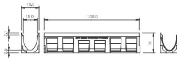
Kanaleta Multiline V 150 dolžine 100 cm